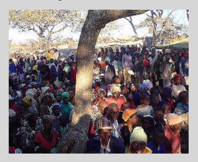
Over 4,000 people in Caledonia Transit Camp.