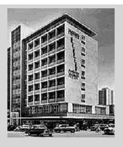
Salisbury: the exclusive colonial city.