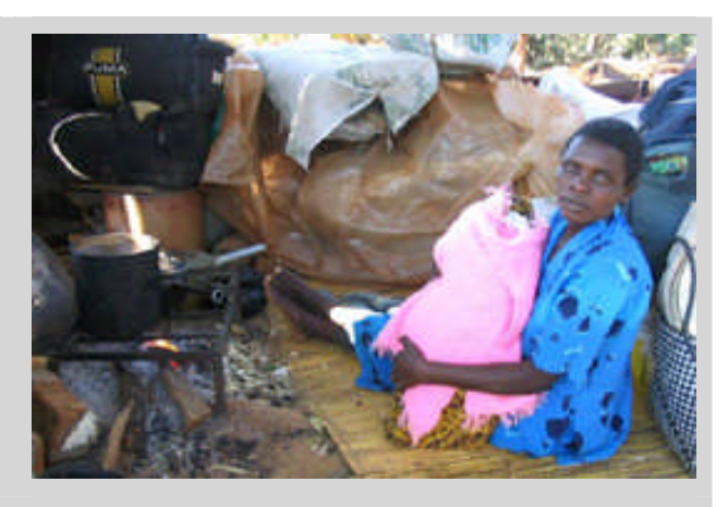
Mother living in the open in Porta Farm, June 30, 2005.