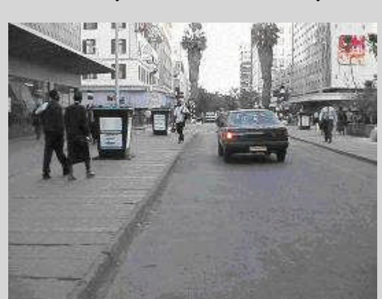
1990's Harare: city of boulevards and clean streets.