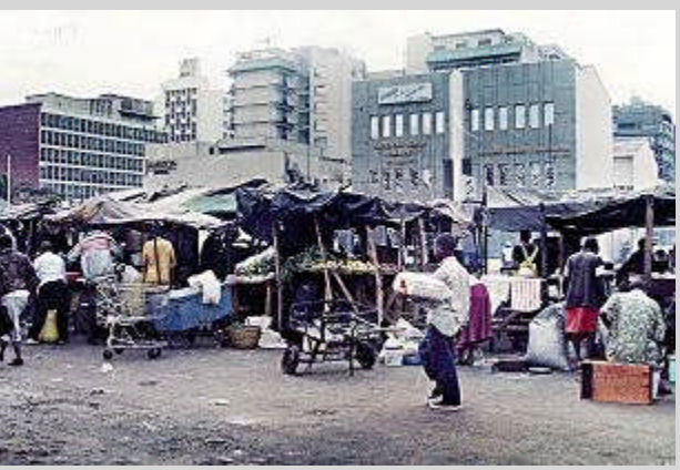
Harare: before Operation Murambatsvina.