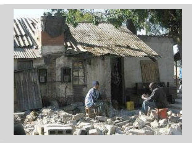
Living amidst the rubble in Mbare.