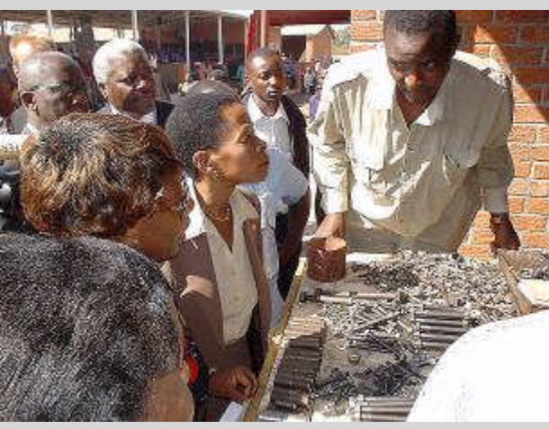
Visiting new stalls for informal traders, Harare.