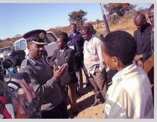
Being briefed about Ngozi demolitions, Bulawayo.