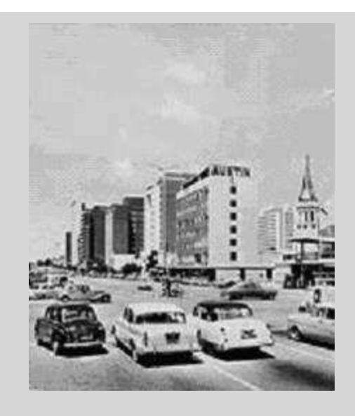
Salisbury: the exclusive colonial city.