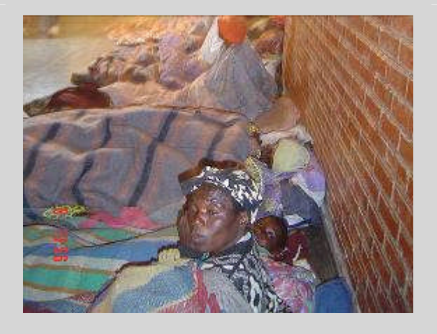
Sheltering in Agape Mission Church, Bulawayo.