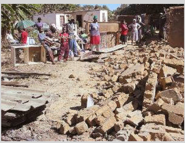
Family Demolishes own house in Epworth, Harare.