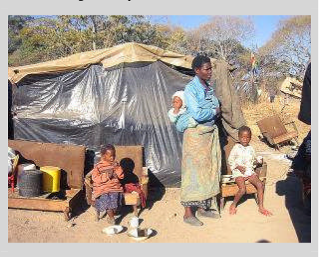
Makeshift shelter in Caledonia Transit Camp.