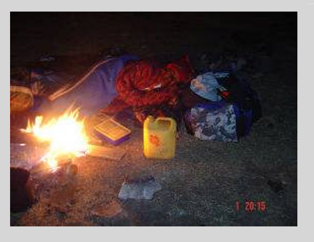
Sleeping out at Sakubva Sports Oval Camp, Mutare.