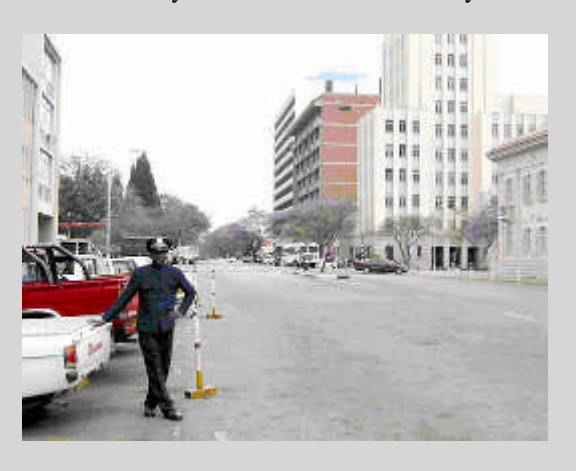
1990's Harare: city of boulevards and clean streets.