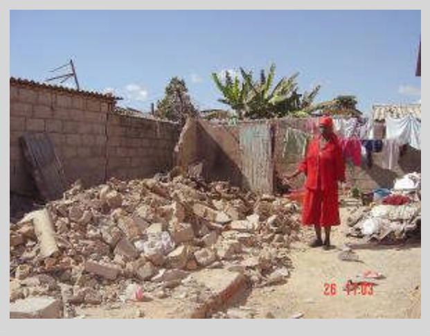
Backyard demolition in Chitingwiza, Harare.