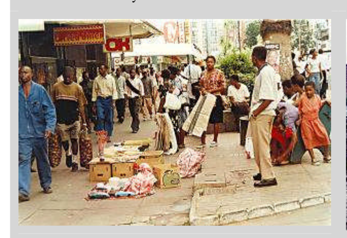
Harare: before\ Operation\ Murambatsvina\ .