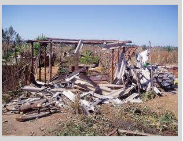
Demolished house at Hatcliffe.