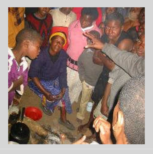
Interviewing woman living in the open, Mutare.