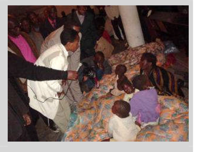
Interviewing families, Agape Mission Church, Bulawayo.