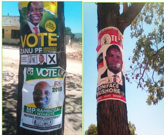
The two major contesting parties namely ZANU PF and MDC Alliance candidates had posters throughout the Mutoko North Constituency

clear difference in the level of investment made in campaigning by political parties. On the one hand, visible campaigns by the MDC Alliance declined towards the election. The alliance did not convene rallies but relied more on door-to-door campaigns and infrequently moved around the constituency in campaign vehicles pasting posters on trees. There was no report on any form of campaigning done by the NCA party or candidate. On the other hand, ZANU-PF, in addition to holding meetings and using the door-to-door campaign method, convened many rallies, distributed party regalia and, in an act that could be considered as vote buying, handed some benefits, for example food aid and seed to party supporters. Given that there was no report on any campaign activities by the NCA, the election was essentially a race between the MDC Alliance and ZANU-PF.