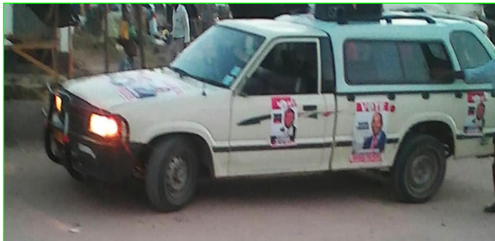
MDC Alliance used this campaign vehicle in Mutoko North to canvass for support