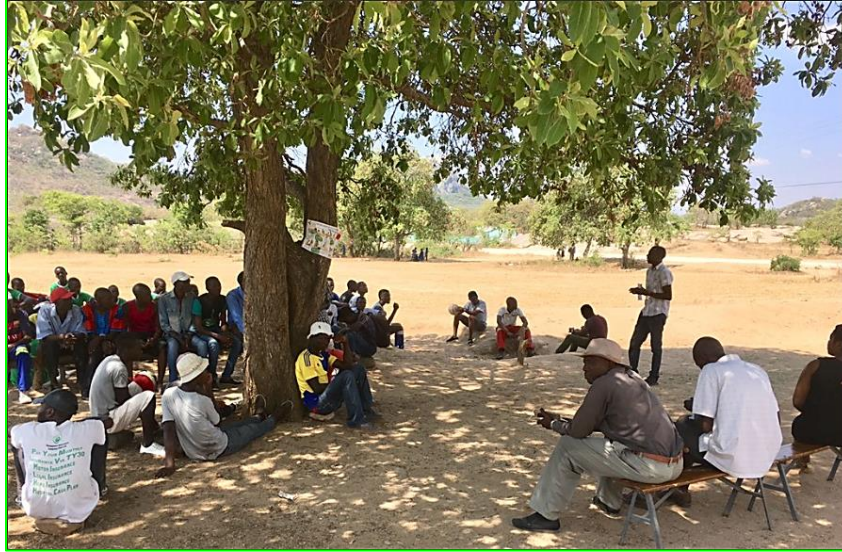
Above: One of the sports tournaments organised by Mutoko Youth Initiatives where voters were entertained as well as encouraged to vote in peace.