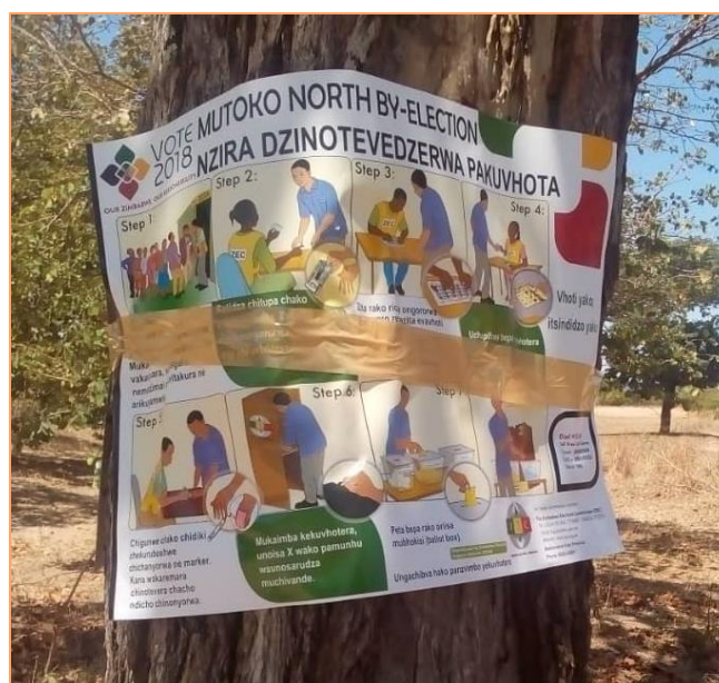
ZESN reproduced and plastered ZEC CVE posters in Mutoko North

In view of the just ended voter education outreach for the by-election, ZESN recommends that voter education should be done on a continuous basis. ZESN noted that ZEC had only allocated 7 days for the outreach which was very limited time. Accrediting more local stakeholders, especially the FBOs, will help complement ZEC voter education efforts. This will help counter misinformation and bias by some traditional leaders who were observed campaigning for the ruling party. It is also recommended that ZEC allocates more resources for IEC materials as some of the ZEC teams had limited and, in some cases, no materials. ZEC should also employ other methods of conducting voter education and not rely on door to door since it is time consuming and generally more expensive.