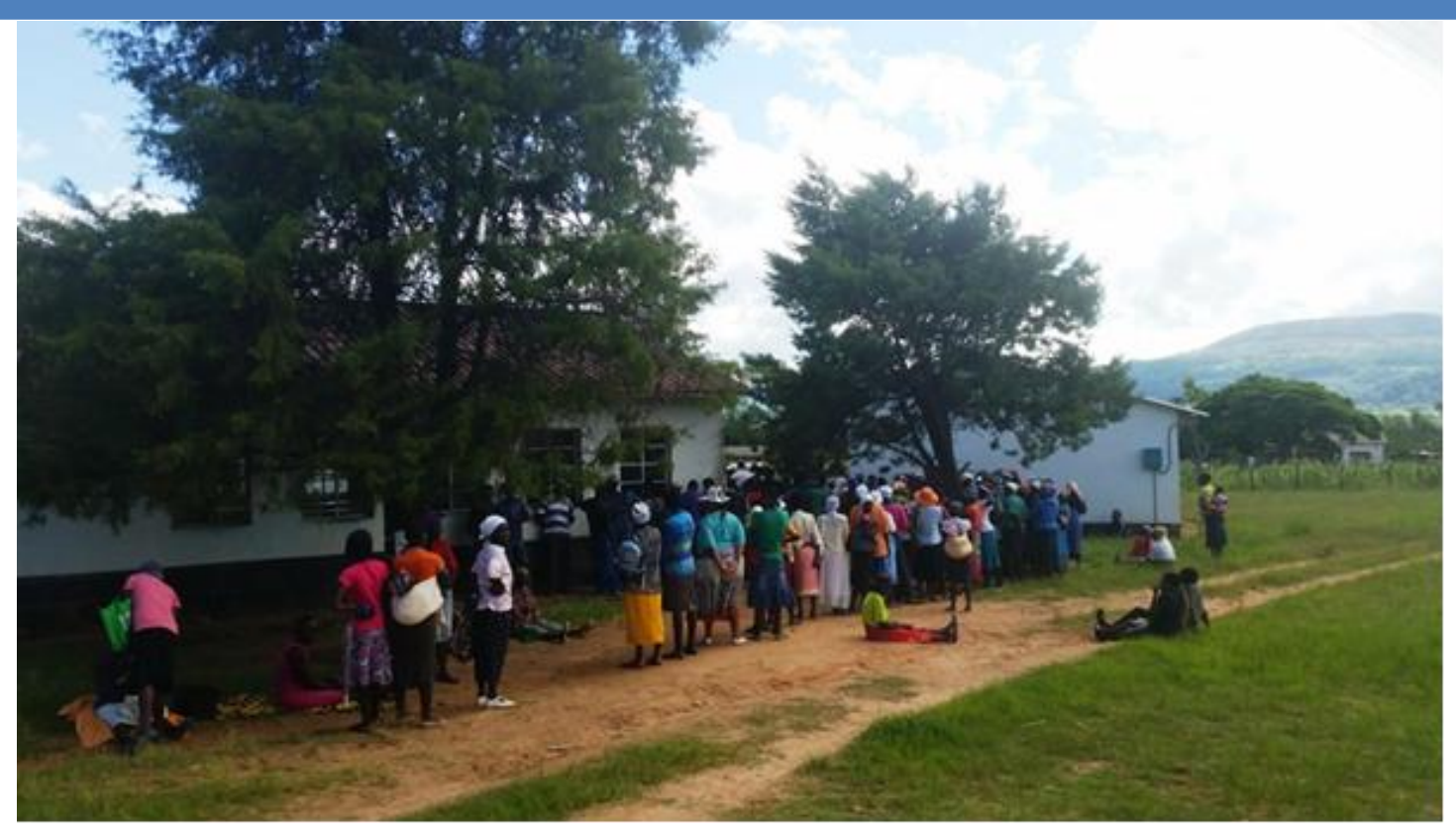
Njaravaza Primary School Polling Station in Bikita West, Ward 10