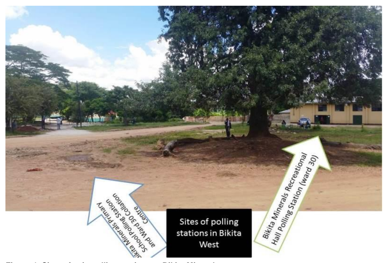
Figure 4: Sites of twin polling stations at Bikita Minerals